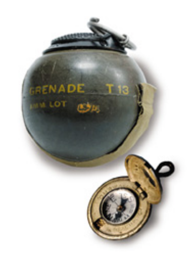
OSS <u>T13 Beano Grenade</u> and compass hidden in a button, CIA Museum

tasteless poison tablets ("K" and "L" pills), and cigarettes laced with tetrahydrocannabinol acetate (an extract of Indian hemp) to induce uncontrollable chattiness. [21][22][23]