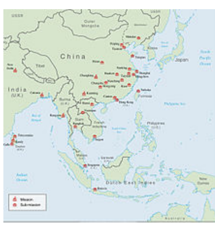
OSS missions and bases in East Asia

For the duration of World War the Office of Strategic Services conducting was multiple activities and missions, including collecting intelligence by spying, performing acts of sabotage, waging propaganda organizing war, and coordinating anti-Nazi resistance groups in Europe, and providing military training anti-Japanese guerrilla movements in Asia, among other things.[8] At the height of its influence during World War