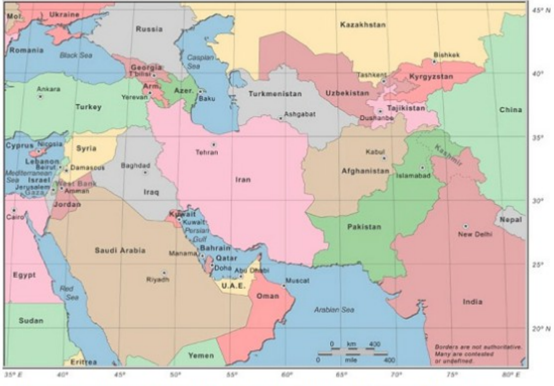
Regime-change Syria: Isolate Iran, Limit Russian and Chinese Influence

As I have noted in previous essays, sometimes the strategy isn't to control the assets being contested so much as disrupt competitors' enjoyment of the assets and send signals about future costs and consequences.