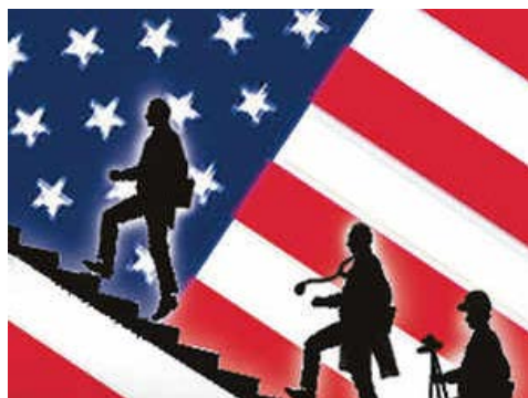
The State Department estimates that the new visa forms would affect 710,000 immigrant and 14 million non-immigrant visa applicants.

WASHINGTON: The Trump administration wants all US visa applicants to submit details of their previous phone numbers, email addresses and social media histories as part of its "vetting" practice and to prevent entry of individuals who might pose a threat to the country.