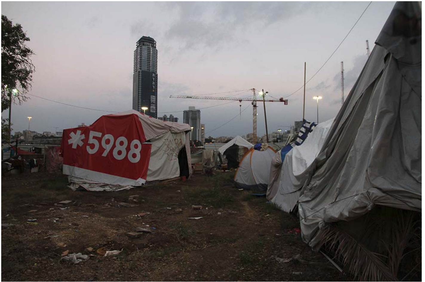
— IMG_0247.JPG —